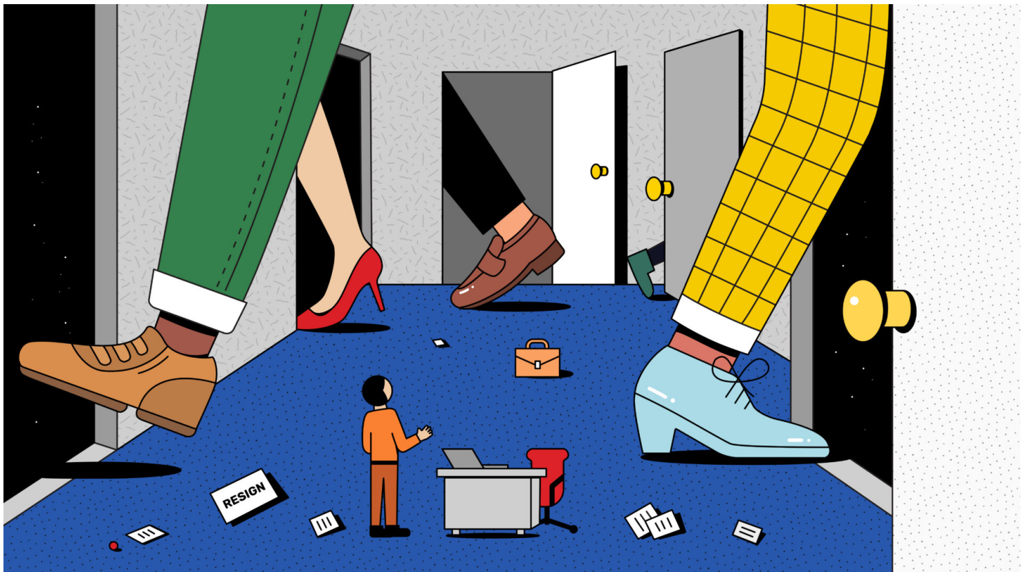
Illustration by Simo Liu